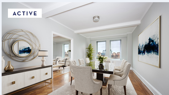
1200 FIFTH AVENUE #14A

4 beds | 4.5 baths | Listed for $3,900,000