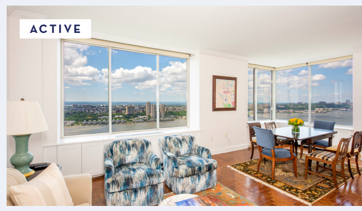
200 RIVERSIDE BLVD PH #1B

5 beds | 7.5 baths | For Lease at $48,000/Mo