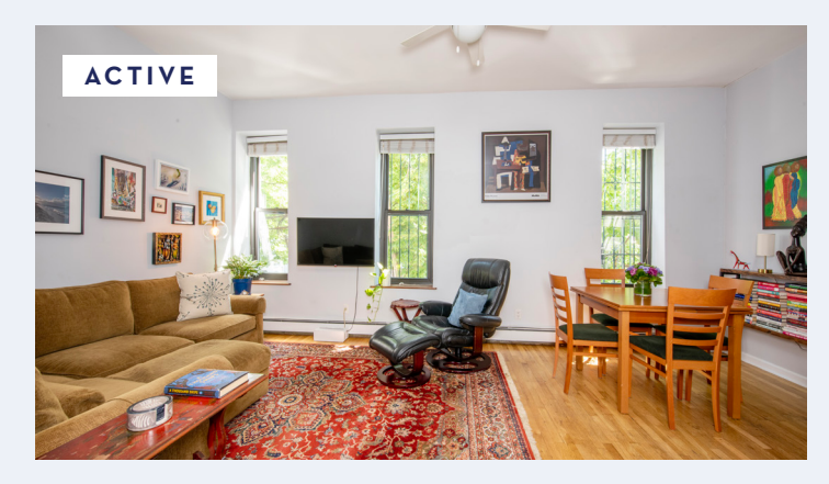
295 SAINT MARK'S AVENUE #2B

It would be our honor to feature your home and get incredible results. Contact us today to discuss.