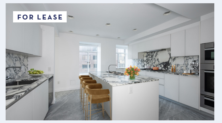
737 PARK AVENUE #12E

5 beds | 7.5 baths | For Lease at $48,000/Mo